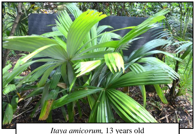
Itaya amicorum, 13 years old in the Beck Garden