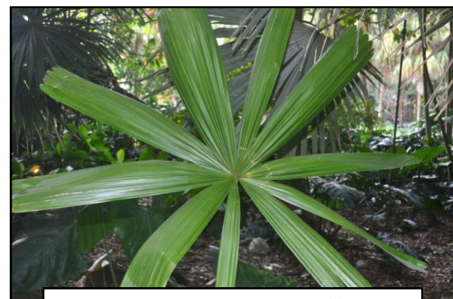
Itaya amicorum, 19 years old at Fairchild Tropical Botanic Garden