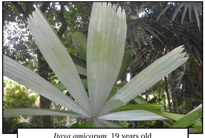
Itaya amicorum, 19 years old at Fairchild Tropical Botanic Garden