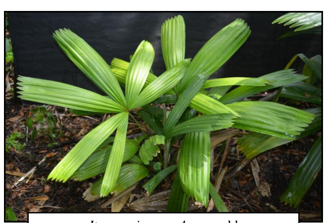
Itaya amicorum, 4 years old in the Beck Garden